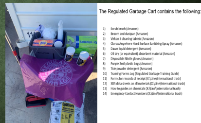
The Regulated Garbage Cart contains the following: